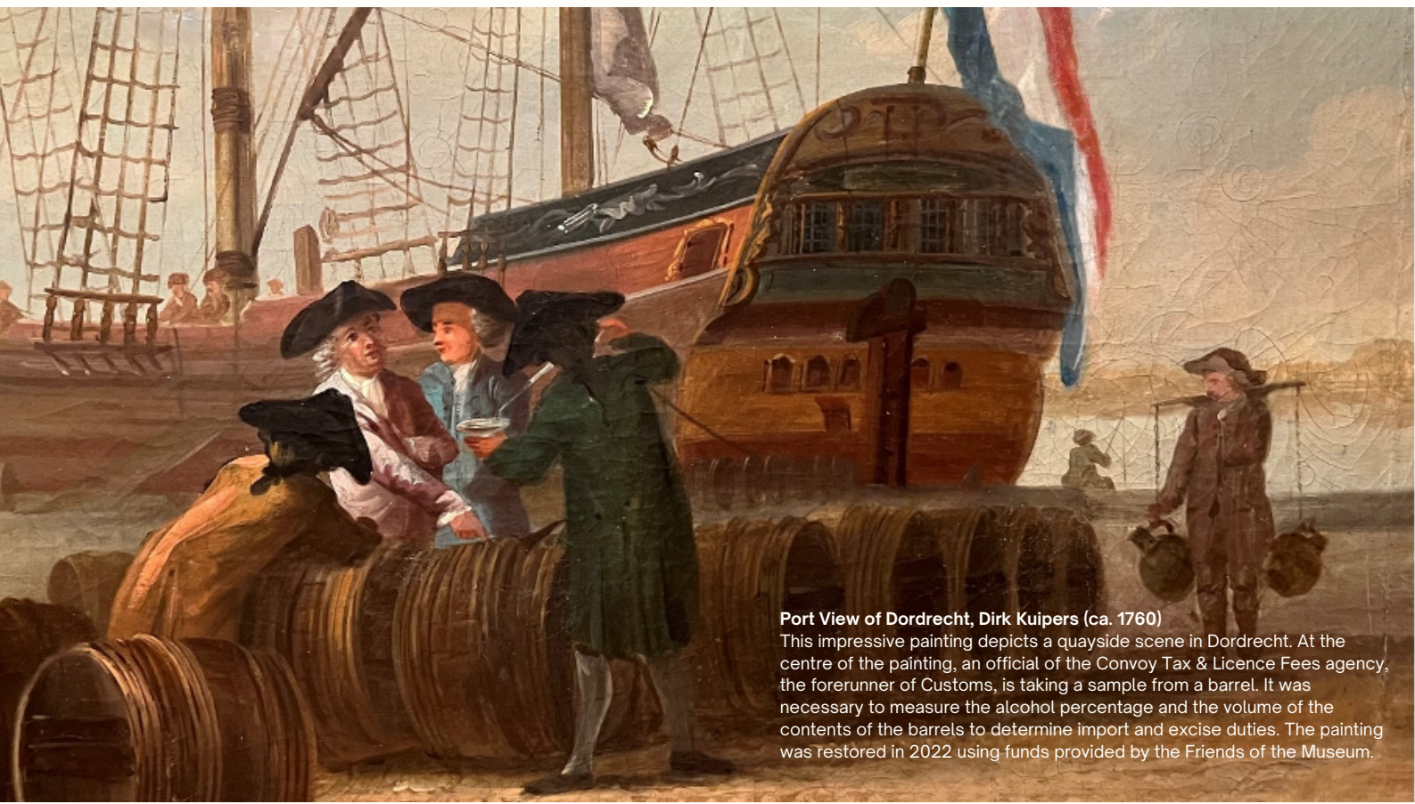
Port View of Dordrecht, Dirk Kuipers (ca. 1760)

This impressive painting depicts a quayside scene in Dordrecht. At the centre of the painting, an official of the Convoy Tax & Licence Fees agency, the forerunner of Customs, is taking a sample from a barrel. It was necessary to measure the alcohol percentage and the volume of the contents of the barrels to determine import and excise duties. The painting was restored in 2022 using funds provided by the Friends of the Museum.